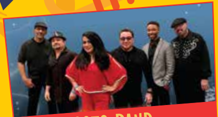
SOTO BAND THURSDAY, AUGUST 25TH