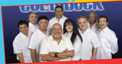
COLD DUCK THURSDAY, JUNE 9TH