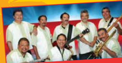
ACE BAND THURSDAY, AUGUST 11TH

CITY HALL FRONT LAWN 1415 Santa Anita Ave., South El Monte