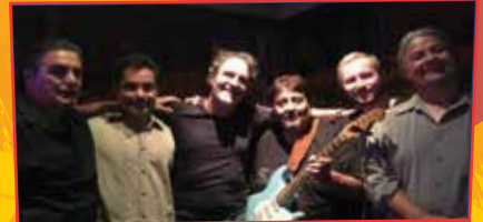
SHADES OF LA THURSDAY, JUNE 23RD