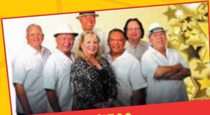
CHICO THURSDAY, JULY 14TH