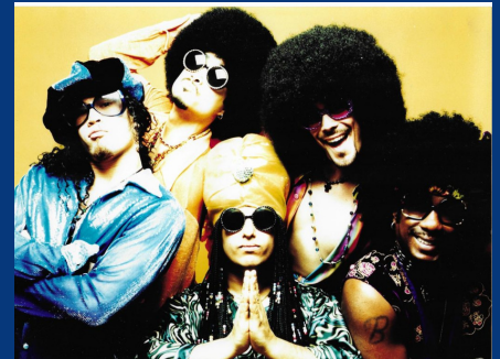
THE FUNKY HIPPEEZ 6:30 PM - 8:30 PM